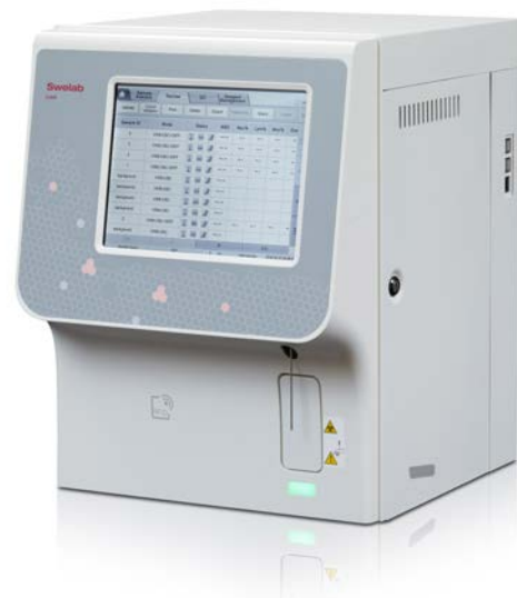
Figure 1. Swelab Lumi is an entry-level 5-part hematology analyzer intended for the cost-minded clinical laboratory. The user-friendly design makes system operations easy. Robust software and hardware components ensure a reliable system performance. With its small footprint, Swelab Lumi is well suited for the typical physician office laboratory.

Abbreviations and acronyms: Basophiles, BASO; complete blood count, CBC; eosinophils, EOS; hematocrit, HCT; hemoglobin, HGB; in vitro diagnostics, IVD; lymphocytes, LYM; mean cell volume, MCV; mean corpuscular hemoglobin, MCH; mean corpuscular hemoglobin concentration, MCHC; mean platelet volume, MPV; monocytes, MONO; neutrophils, NEU; platelets, PLT; platelet distribution width, PDW; red blood cells, RBC; red cell distribution width, RDW; research use only, RUO; white blood cells, WBC.