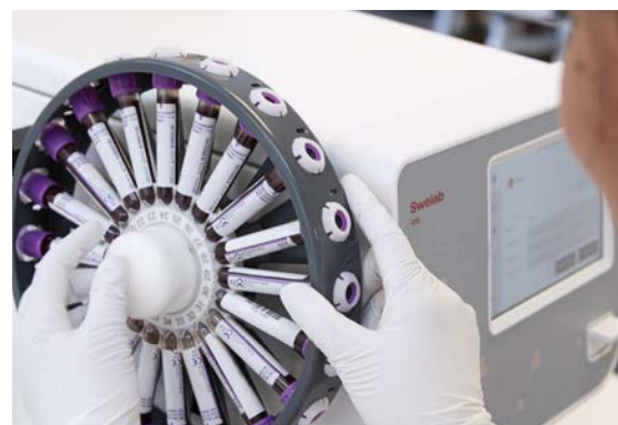
Pre-load up to 2 \times 20 samples and let Swelab Alfa Plus Sampler do the work.

Much as you will enjoy working with your Swelab analyzer, there will be times when you need to leave it to analyze a whole batch of samples by itself. For these occasions, the Sampler model is the instrument of choice to have on your bench. As the top-of-the-range model, Swelab Alfa Plus Sampler is the walk-away analyzer well-suited for many small- to medium-sized hospitals. Just pre-load up to 2 \times 20 samples and let it do the work!