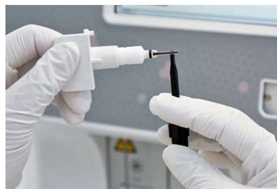
Swelab Alfa Plus analyzers deliver a full CBC from just 20 \mu L of blood, suitable for children and blood banks.

Three Swelab Alfa Plus analyzers include micro-pipette adapter (MPA) sampling. This feature transforms Swelab into one of the fastest blood cell counters in the world. Simply make a finger stick, draw blood into the special 20 \mu L micro-capillary tube, slide it into the adapter and insert it in the analyzer. In about one minute later, you see the full blood status on the touchscreen. No preparation, no pre-dilution, no vacuum tubes and no needles are required. As making a finger stick is largely painless, MPA is suitable to take and analyze blood samples from children. For blood banks, MPA allows for making fast, pre-donation blood testing, while saving the vein for donation.