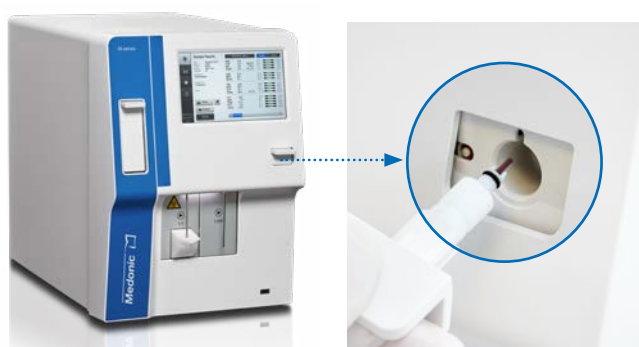
Figure 1. Medonic M32 hematology analyzer with the MPA module.

This work compares the results from samples collected by the capillary methods for analysis using MPA with samples collected by venipuncture.