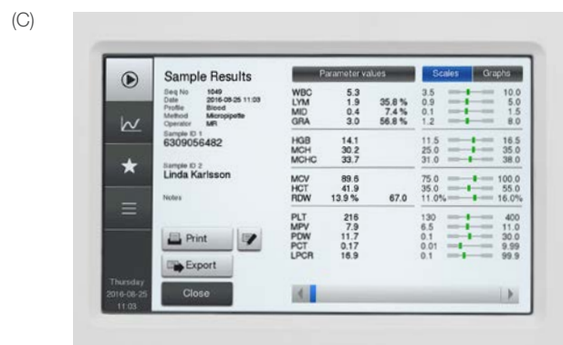
Figure 2. MPA function offers fast pre-donation testing. (A) Take a finger-stick blood sample. (B). The MPA adapter lets you analyze capillary samples directly and saves the vein for donation. (C) In one minute, key results can be viewed on the touchscreen.