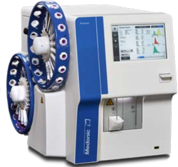
Medonic M32S – Autoloader for up to 2 \times 20 samples. Just load and walk away.

Contact us today for more details of the Medonic M32 hematology analyzer and its blood bank applications.