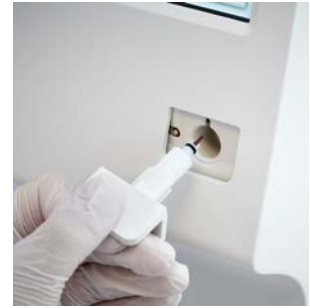
The MPA functionality lets you analyze capillary samples directly and saves the vein for donation.