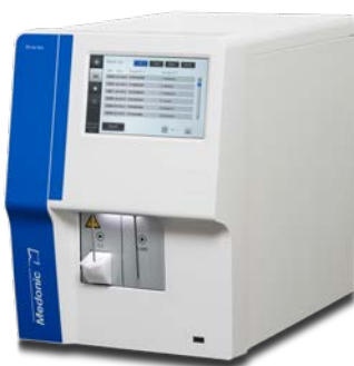
Medonic M32B – even the basic model includes shear-valve technology.