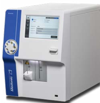
Medonic M32M – five-sample mixer is well-suited for doctors' offices and small labs.