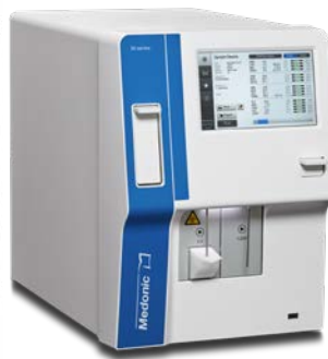
Medonic M32C – closed-tube sampling minimizes risks from contaminated blood.