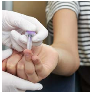
Take a finger-stick blood sample.

Medonic M32 features MPA capillary blood sampling. Simply make a finger-stick, draw blood into a special 20 µL micro-capillary tube, slide it into the adapter, and insert in the analyzer. About one minute later, you view all the key results on the touch-sensitive display. No preparation, no pre-dilution, no vacuum tubes, and no needles are required. As well as making fast, pre-donation blood cell determinations, MPA also saves the vein for donation.