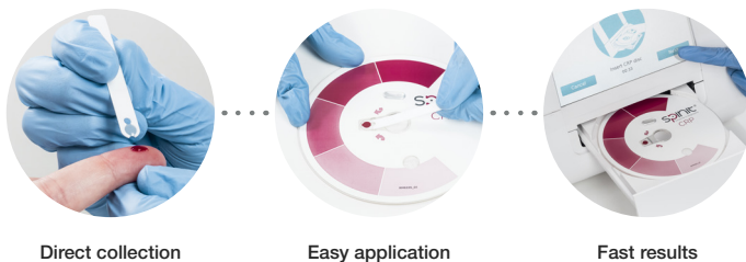
Fig 4. The spinit test discs integrate everything required for sample analysis, just collect blood, apply to disc, and insert in instrument. Results will be displayed in a few minutes.

While the 3-part hematology analyzer can be used for the larger part of all samples, requiring a simple CBC only, the spinit BC test can be used with samples for which a 5-part WBC differential is requested. The spinit BC test