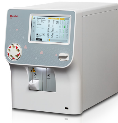
Fig 1. Swelab™ Alfa Plus hematology analyzer provides a complete blood count from a simple finger-stick capillary sample in just one minute.

In general screenings of patients' health status, a complete blood count (CBC) is typically requested. Today, such an analysis is performed using an automated hematology analyzer. In addition to reporting the number of oxygen-carrying red blood cells (RBCs), platelets (PLTs) that help blood clot, and white blood cells (WBCs) of the immune system, the analyzer also measures the oxygen-containing hemoglobin (HGB) and determines a range of other parameters such as the mean RBC and PLT volumes and hematocrit (HCT), that is, the red blood cell-to-plasma ratio. Depending on the differentiation of the WBCs, hematology analyzers are divided into 3-part systems and 5-part systems (2). In addition to a CBC, a 5-part analysis differentiates the WBCs into their five main subgroups, neutrophils (NEU), lymphocytes (LYM), monocytes (MONO), eosinophils (EOS), and basophils (BASO), while a 3-part analyzer combines NEU (60% of WBC count), EOS (1%–4% of WBC count), and BASO