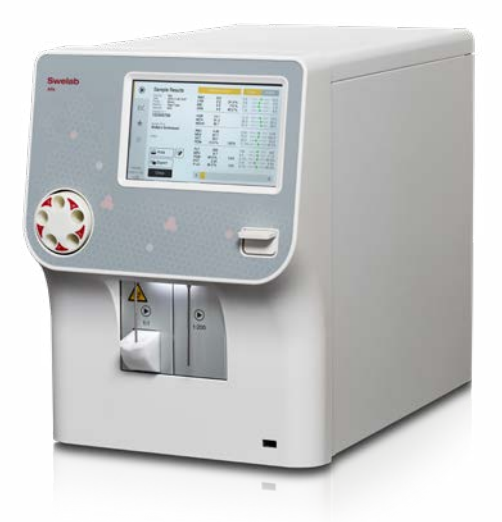
Fig 1. Swelab™ Alfa Plus hematology analyzer provides a complete blood count from a simple finger-stick capillary sample in just one minute.

Depending on the differentiation of the WBCs, hematology analyzers are divided into 3-part systems and 5-part systems (2). In addition to a CBC, a 5-part analysis differentiates the WBCs into their five mains subgroups, neutrophils (NEU), lymphocytes (LYM), monocytes (MONO), eosinophils (EOS), and basophils (BASO), while a 3-part analyzer combines NEU (60% of WBC count), EOS (1%–4% of WBC count), and BASO (0.5%–1% of WBC count) into granulocytes (GRAN), of which NEUs constitute the largest part. For fever investigations, for example, the NEU and LYM counts will answer the question of a viral infection or a bacterial infection that can be treated with antibiotics.