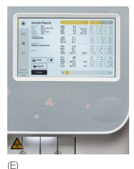
Fig 3. Swelab Alfa Plus automated hematology system equipped with the micro-pipette-adapter (MPA) inlet for capillary samples is designed for blood testing in a near-patient clinical setting. (A) Make a deep and firm skin puncture. (B) Collect 20 μL blood into the K2EDTA-coated micro-pipettes. (C) Slide the tube into the adapter. (D) Insert the adapter into the analyzer. (E) CBC results are viewable on the display in about one minute.