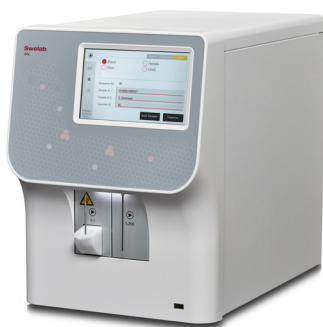
Swelab Alfa Plus Basic – even the basic model includes shear-valve technology.

Four Swelab Alfa Plus analyzer models span a wide range of easy-to-use functions. All deliver highly accurate and precise blood cell counts.