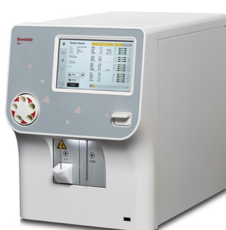
Swelab Alfa Plus Standard – five-sample mixer is well-suited for the smaller laboratory.