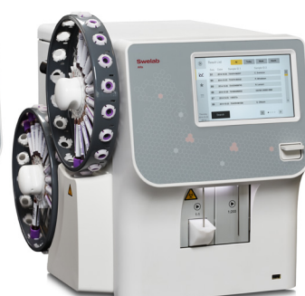
Swelab Alfa Plus Sampler – for up to 2 \times 20 samples. Just load and walk away.

Contact us today for more details of the Swelab Alfa Plus hematology analyzer and its blood bank applications.