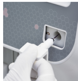
The MPA functionality lets you analyze capillary samples directly and saves the vein for the donation.