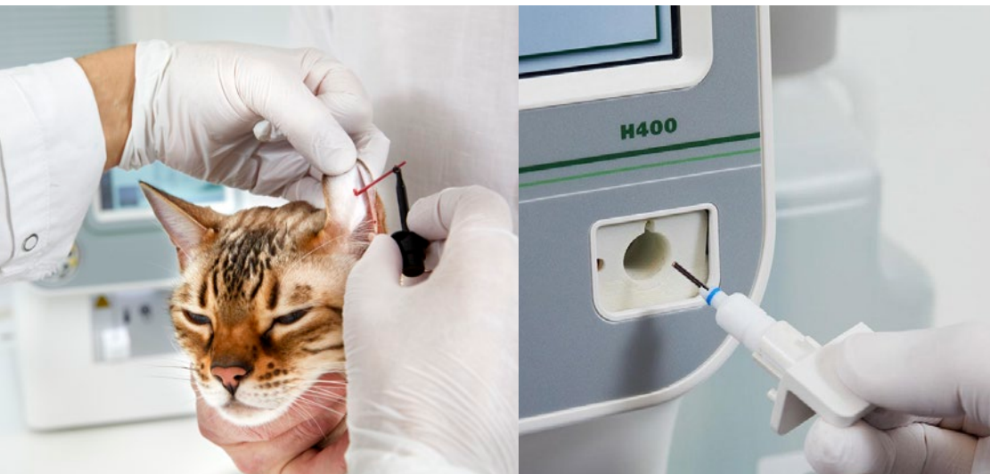
Fig 1. The MPA capillary sample feature of the Exigo H400 is especially suitable for smaller animals such as cats.

In general, small cells demand a higher sensitivity of the analyzer to be counted correctly. To allow accurate count of the smaller blood cells, the Exigo H400 is equipped with a narrower capillary aperture for the RBC and PLT count compared with human cell counters. The narrower aperture, with a diameter of 60 \mu\text{m} (Fig 2), allows for smaller corpuscles such as the PLTs and certain RBCs to be detected with a higher sensitivity compared to a standard instrument.