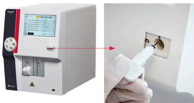
Figure 1. Swelab Alfa Plus hematology analyzer with the MPA module.

This work compares the results from samples collected by the capillary method for analysis using MPA with samples collected by venipuncture.