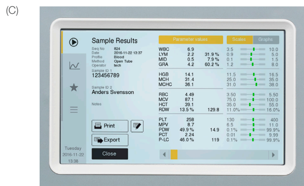
Figure 2. MPA function offers fast pre-donation testing. (A) Take a finger-stick blood sample. (B) The MPA adapter lets you analyze capillary samples directly and saves the vein for donation. (C) In one minute, key results can be viewed on the touchscreen.