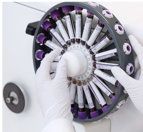
The tubes are easily loaded in the sampling wheel.

The sample wheels accommodate 20 standard 4 to 5 mL tubes. Sampling wheels specifically designed for Sarstedt tubes are also available. Medonic M32S is not only compact, it is also easy to operate.