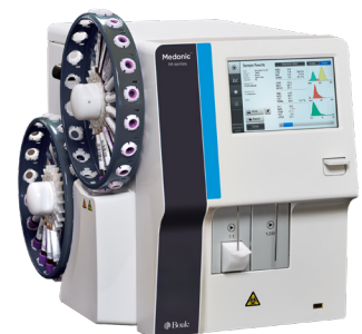
Medonic M32S – autoloader for up to 2 \times 20 samples. Just load and walk away.