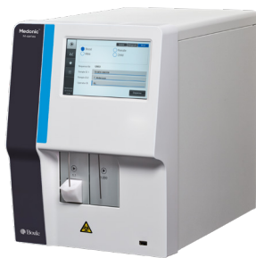
Medonic M32B – even the basic model includes shear-valve technology.

Four Medonic M32 analyzer models span a wide range of functions. All deliver highly accurate and precise blood cell counts.