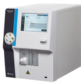
Medonic M32M – five-sample mixer is well-suited for the smaller laboratory.