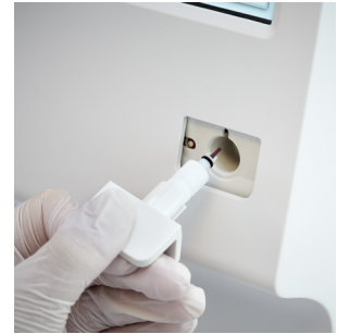
The MPA functionality lets you analyze capillary samples directly and saves the vein for the donation.