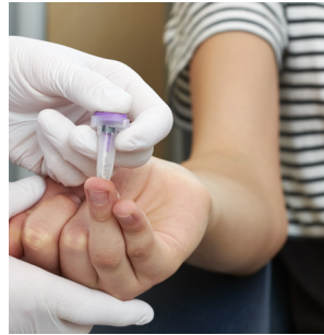
Take a finger-stick blood sample.

Medonic M32 features MPA capillary blood sampling. Simply make a finger-stick, draw blood into a special 20 \mu\text{L} micro-capillary tube, slide it into the adapter, and insert in the analyzer. About one minute later, you view all the key results on the touch-sensitive display. No preparation, no pre-dilution, and no vacuum tubes are required. As well as making fast, pre-donation blood cell determinations, MPA also saves the vein for the donation.