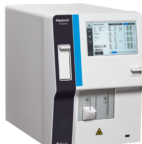
Medonic M32C – closed-tube sampling minimizes risks from contaminated blood.