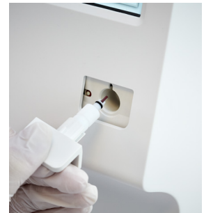
The MPA functionality lets you analyze capillary samples directly and saves the vein for the donation.