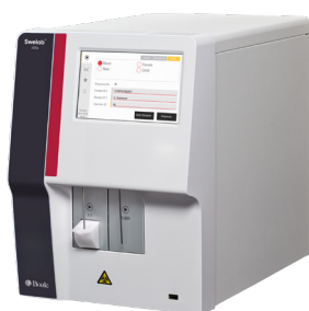
Swelab Alfa Plus Basic – even the basic model includes shear-valve technology.

Four Swelab Alfa Plus analyzer models span a wide range of easy-to-use functions. All deliver highly accurate and precise blood cell counts.