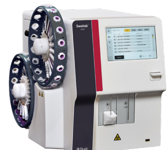
Swelab Alfa Plus Sampler – for up to 2 \times 20 samples. Just load and walk away.