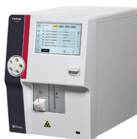
Swelab Alfa Plus Standard – five-sample mixer is well-suited for the smaller laboratory.