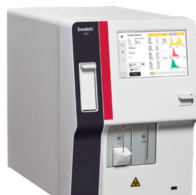
Swelab Alfa Plus Cap – closed-tube sampling minimizes risks from contaminated blood.