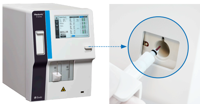
Figure 1. Medonic M32 hematology analyzer with the MPA module.

This work compares the results from samples collected by the capillary methods for analysis using MPA with samples collected by venipuncture.