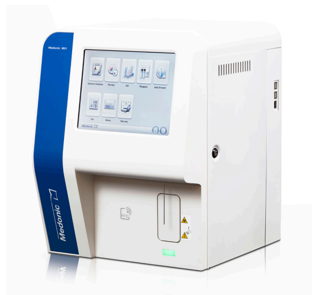
Figure 1. Medonic M51 is an entry-level 5-part hematology analyzer intended for the cost-minded clinical laboratory. The user-friendly design makes system operations easy. Robust software and hardware components ensure a reliable system performance. With its small footprint, Medonic M51 is well suited for the typical physician office laboratory.

Abbreviations and acronyms: Basophiles, BASO; complete blood count, CBC; eosinophils, EOS; hematocrit, HCT; hemoglobin, HGB; in vitro diagnostics, IVD; lymphocytes, LYM; mean cell volume, MCV; mean corpuscular hemoglobin, MCH; mean corpuscular hemoglobin concentration, MCHC; mean platelet volume, MPV; monocytes, MONO; neutrophils, NEU; platelets, PLT; platelet distribution width, PDW; red blood cells, RBC; red cell distribution width, RDW; research use only, RUO; white blood cells, WBC.