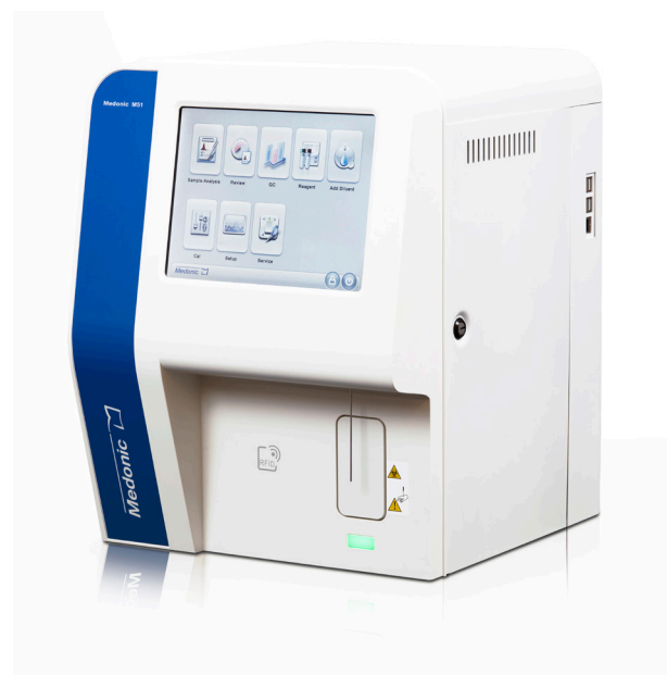
Figure 1. Medonic M51 is an entry-level 5-part hematology analyzer intended for the cost-minded clinical laboratory. The user-friendly design makes system operations easy. Robust software and hardware components ensure a reliable system performance. With its small footprint, Medonic M51 is well suited for the typical physician office laboratory.

Abbreviations and acronyms: Basophiles, BASO; complete blood count, CBC; eosinophils, EOS; hematocrit, HCT; hemoglobin, HGB; in vitro diagnostics, IVD; lymphocytes, LYM; mean cell volume, MCV; mean corpuscular hemoglobin, MCH; mean corpuscular hemoglobin concentration, MCHC; mean platelet volume, MPV; monocytes, MONO; neutrophils, NEU; platelets, PLT; platelet distribution width, PDW; red blood cells, RBC; red cell distribution width, RDW; research use only, RUO; white blood cells, WBC.