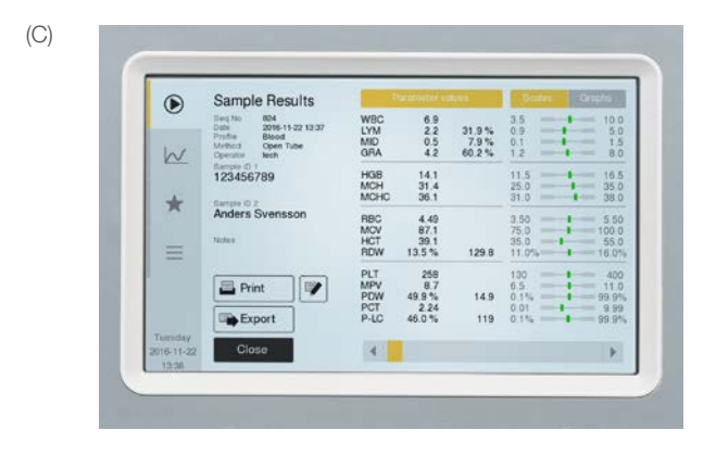
Figure 2. MPA function offers fast pre-donation testing. (A) Take a finger-stick blood sample. (B). The MPA adapter lets you analyze capillary samples directly and saves the vein for donation. (C) In one minute, key results can be viewed on the touchscreen.